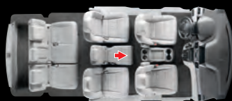
Multi-function center seat slides forward*

Quite possibly the perfect combination of cargo and passenger space.