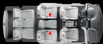
2nd-row "wide mode"

More space for passengers, or more room for 2 child seats in the 2nd row.