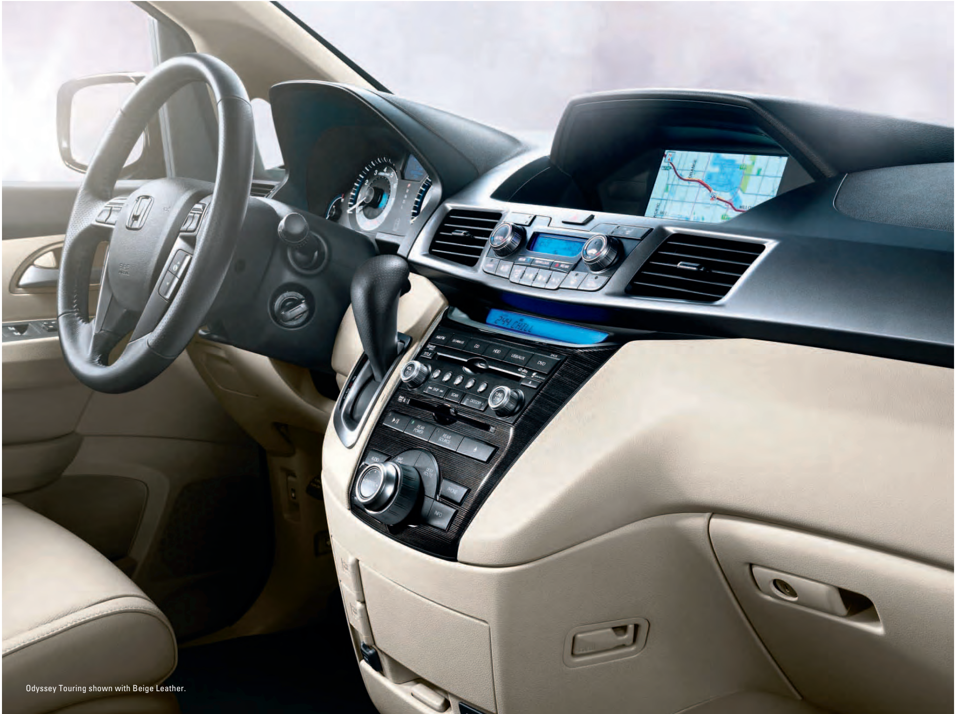
Odyssey Touring shown with Beige Leather.