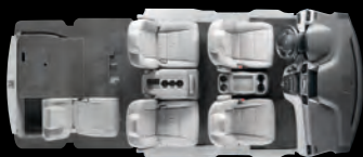
5-passenger cargo mode*

5 passengers and still plenty of cargo space.