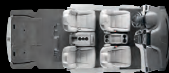
4-passenger cargo mode*

Party of 4? Stow the 3rd row for more cargo space.