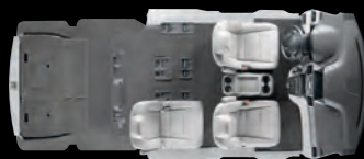
3-passenger cargo mode

The incredibly versatile interior easily adjusts to meet your needs.