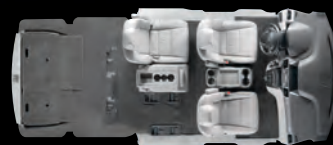
3-passenger cargo mode 2*

With 3 passengers, there's still plenty of room for a surfboard or ladder.