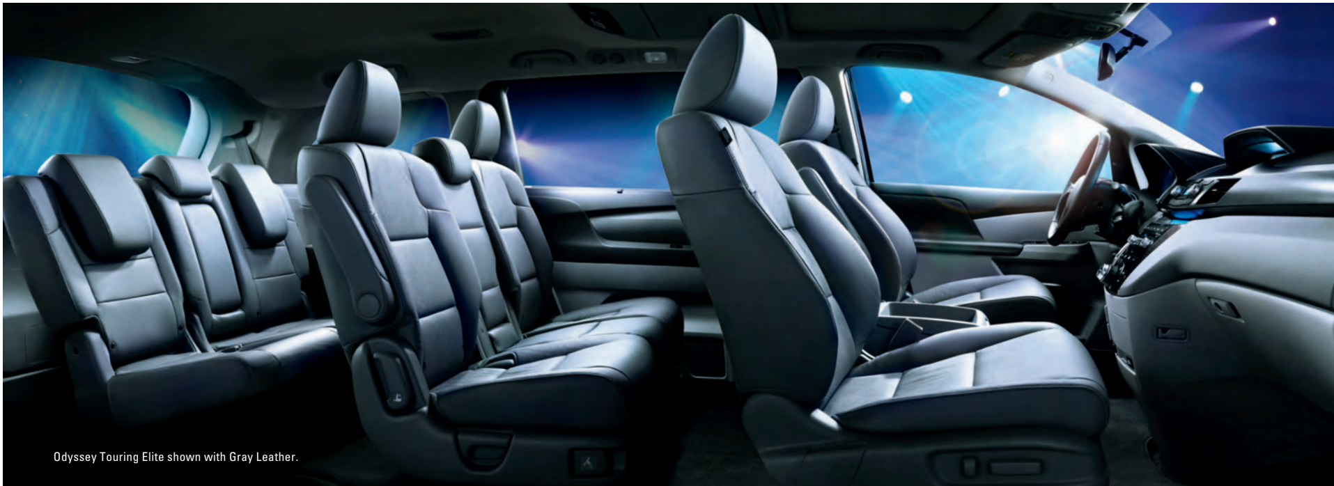
Odyssey Touring Elite shown with Gray Leather.